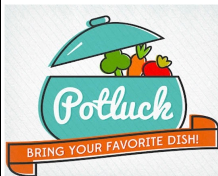
Table Fellowship (Potluck)

Our next table fellowship is Sunday, January 7, 2024 , after the worship service. Please bring a dish of your choice for the potluck.