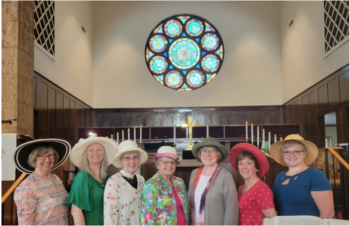
First Presbyterian Bell Ringers